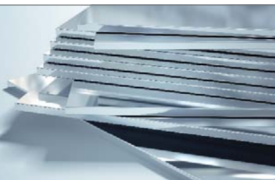
PLATE AND SHEET STOCK (Available cut to size)

Every day, from our Sheffield factory, we dispatch materials of all types - whether stock or processed items working with customers to meet tight delivery schedules.